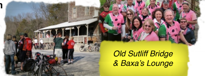
Old Sutliff Bridge & Baxa's Lounge

About 8 miles out of Solon, you will cross the Cedar River bridge (in green) that replaced the very old Sutliff Bridge. Shortly after you cross the bridge there will be a road to the right. This is road to Sutliff and follows the river south (about 1/2 mile). You may wish to stop there on way back.